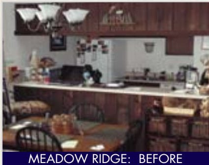
MEADOW RIDGE: BEFORE