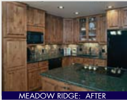
MEADOW RIDGE: AFTER